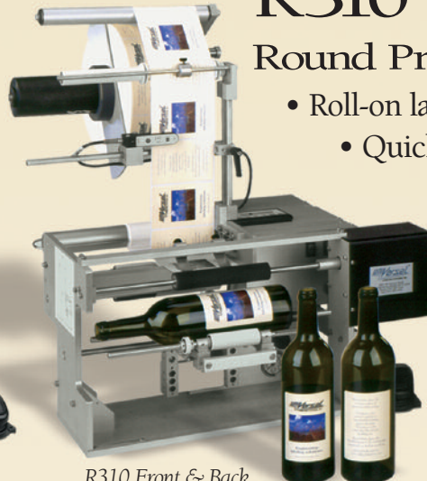
R310 Front & Back